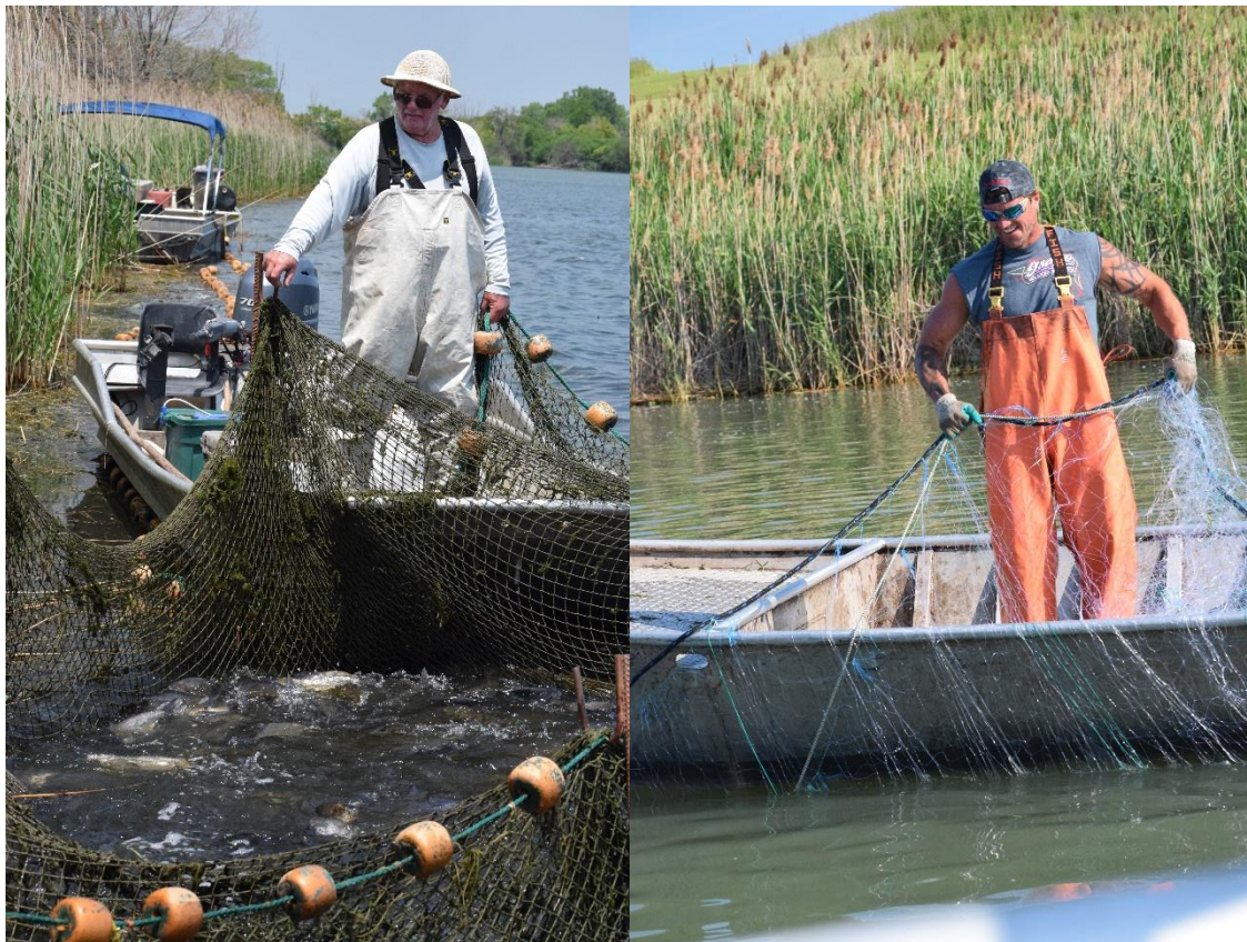
Figure 2. Contracted fisher monitoring a seine (A) and gill net (B) while obliging to social distancing protocols.